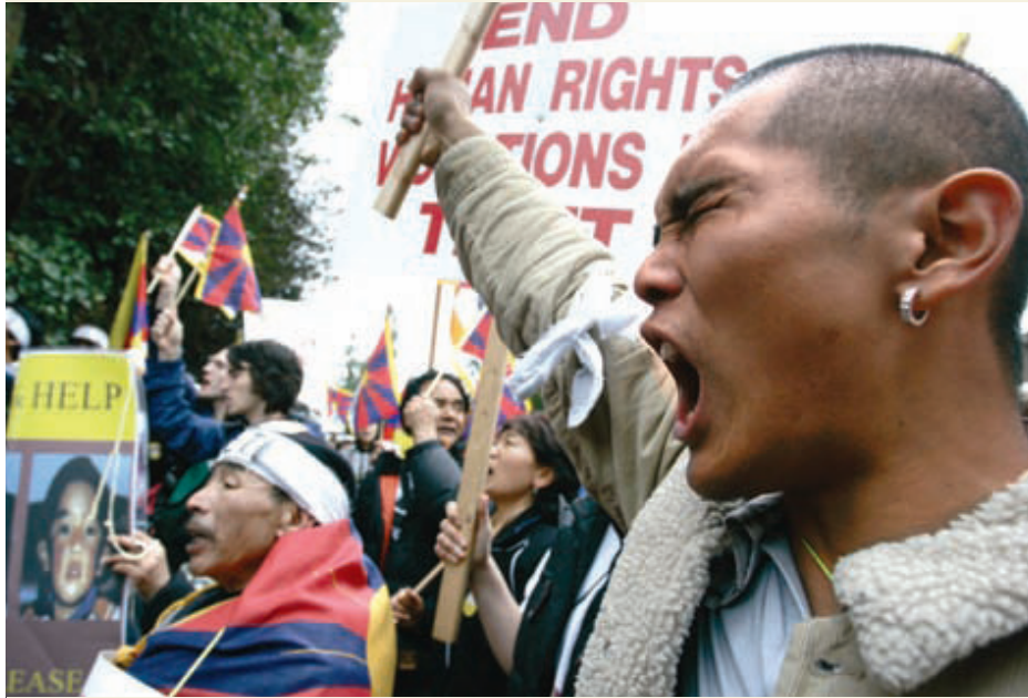
RAFE ANNOTI/METRO VANCOUVER

More than 100 protesters screamed anti-Chinese government slogans during a rally outside the Chinese Consulate on Granville Street yesterday. Tibetans and their supporters staged a mock die-in to mark the 49th anniversary of the 1959 national uprising against China's occupation of Tibet and to bring attention to China's human-rights record.